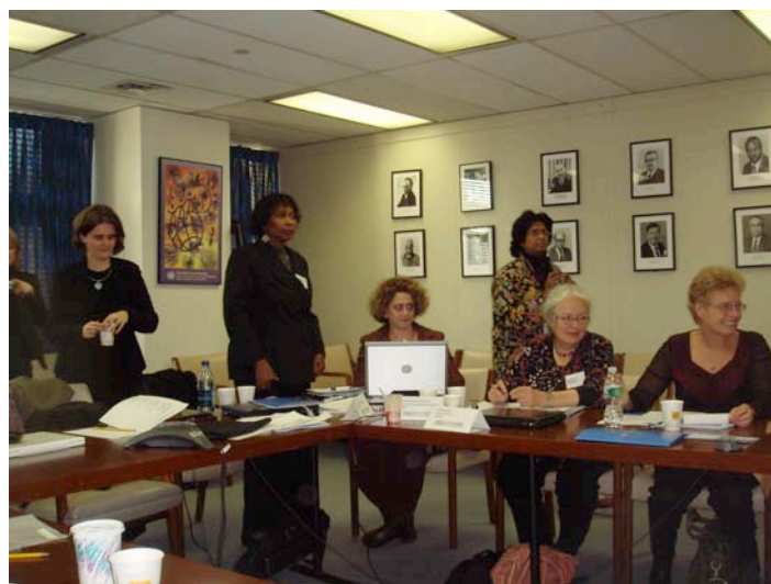
Participants of the Expert Group Meeting on Gender and Water